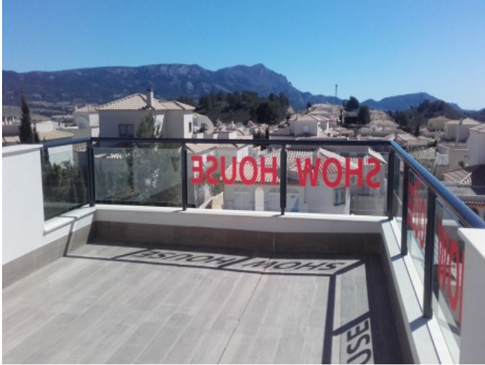
Terrace on the upper floor