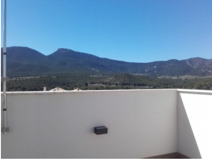
Mountain view from the rooftop terrace