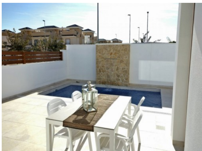
Outside pool area

All information is correct to the best of our knowledge. Errors and prior sale excepted. This prospectus is purely for information purposes. Only the notarized deed of sale is legally binding.