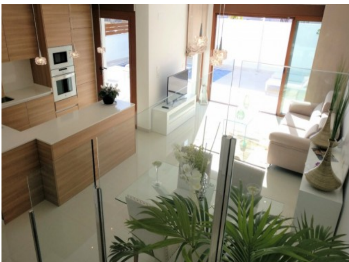
Open plan living room 3/4