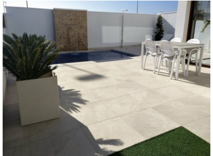
Outside pool area