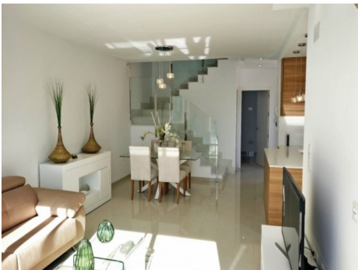
Open plan living room 1/4