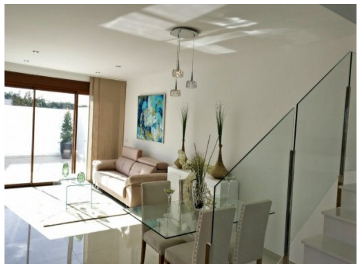
Open plan living room 4/4

All information is correct to the best of our knowledge. Errors and prior sale excepted. This prospectus is purely for information purposes. Only the notarized deed of sale is legally binding.