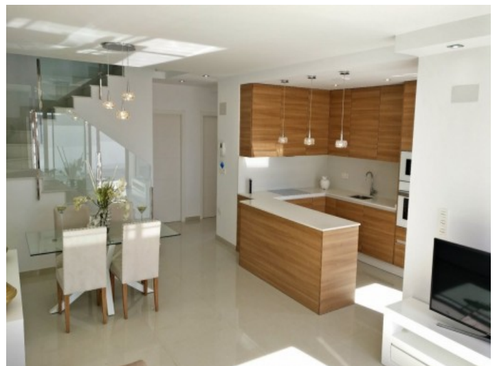
Open plan living room 2/4