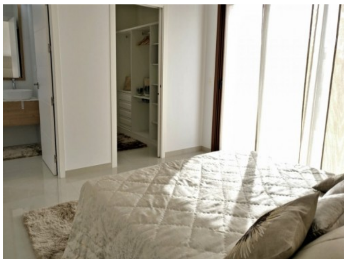
Lightflooded bedroom with ensuite bathroom