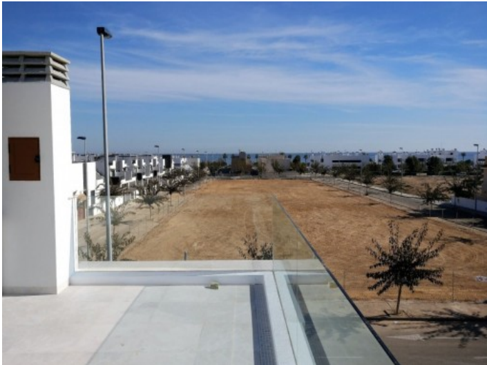
Sea view from rooftop terrace