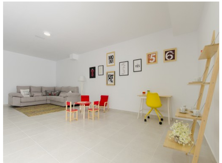
Separate living room