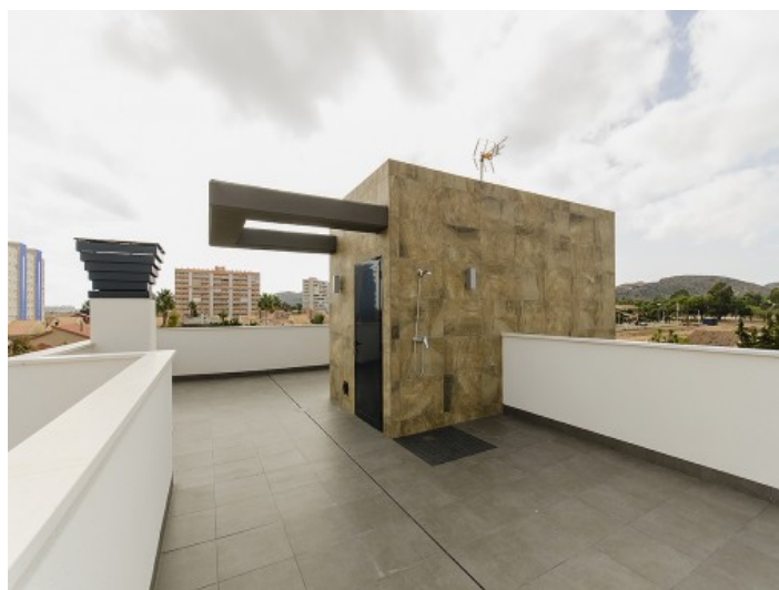
Spacious roof terrace