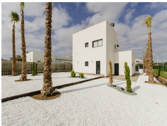
Easy to keep garden area

All information is correct to the best of our knowledge. Errors and prior sale excepted. This prospectus is purely for information purposes. Only the notarized deed of sale is legally binding.