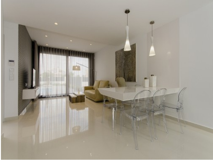
Living room with dining area