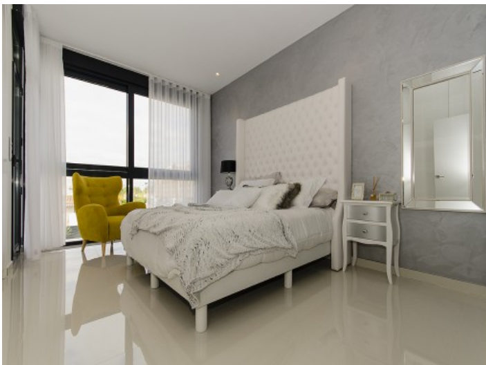
Light flooded bedroom