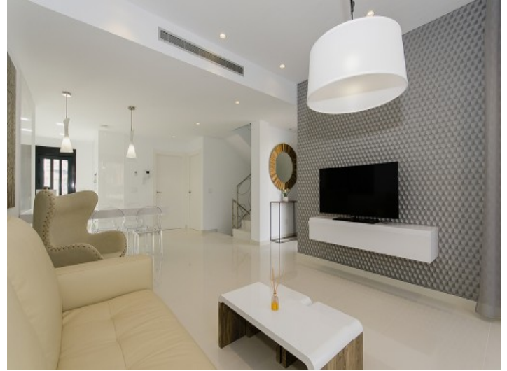
Chic living room