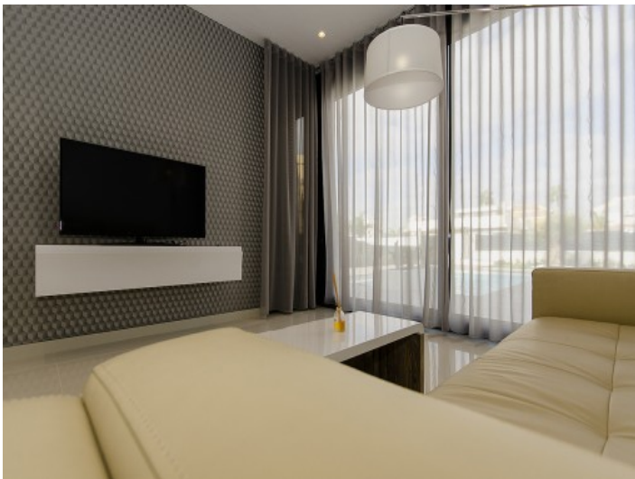
Light-flooded living room