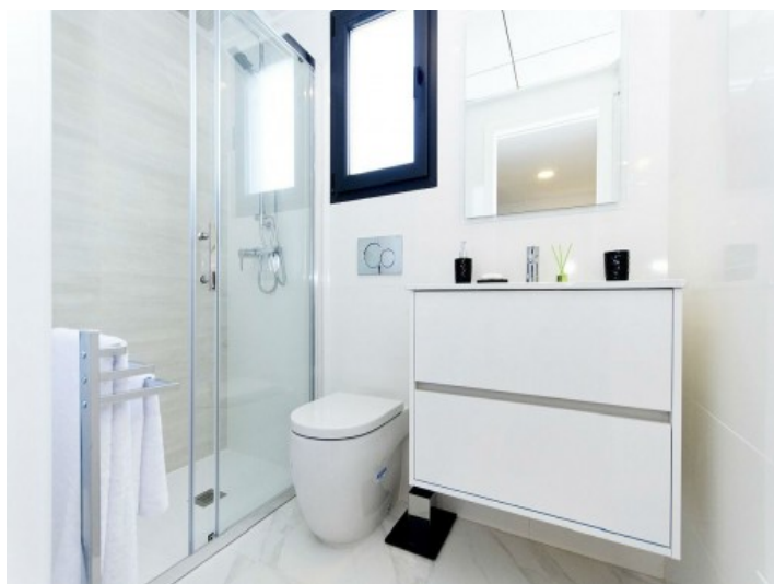
1 of 3 bathrooms