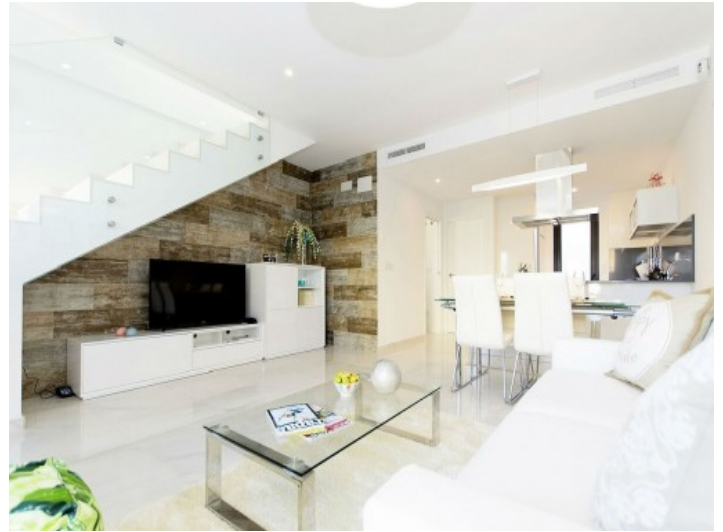
Bright living room