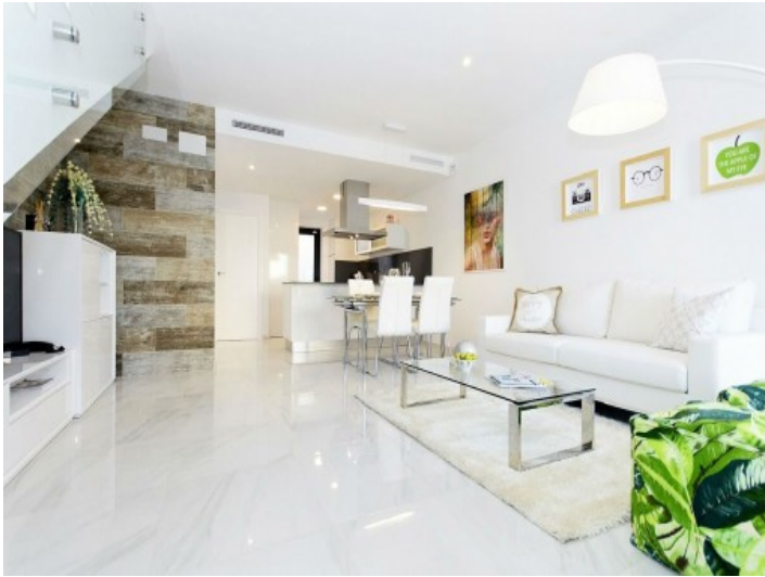
Modern living room