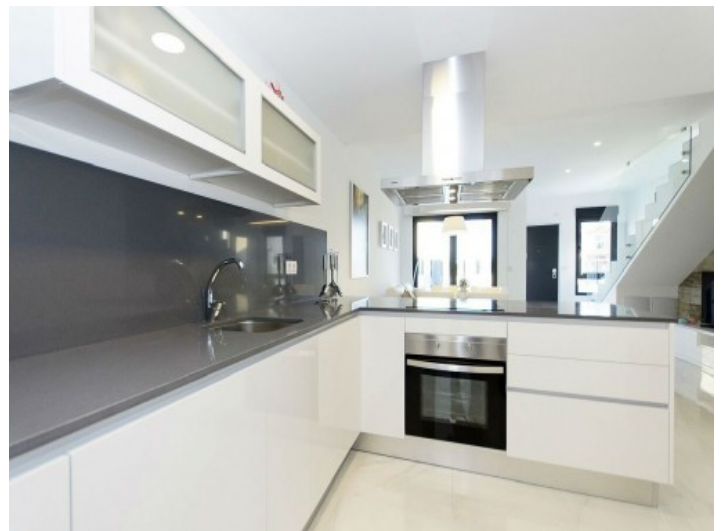
Fully fitted kitchen

All information is correct to the best of our knowledge. Errors and prior sale excepted. This prospectus is purely for information purposes. Only the notarized deed of sale is legally binding.