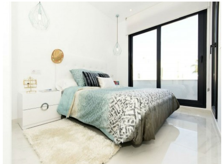
1 of 3 bedrooms