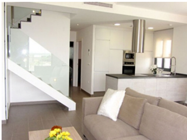
Newly built villa with modern design