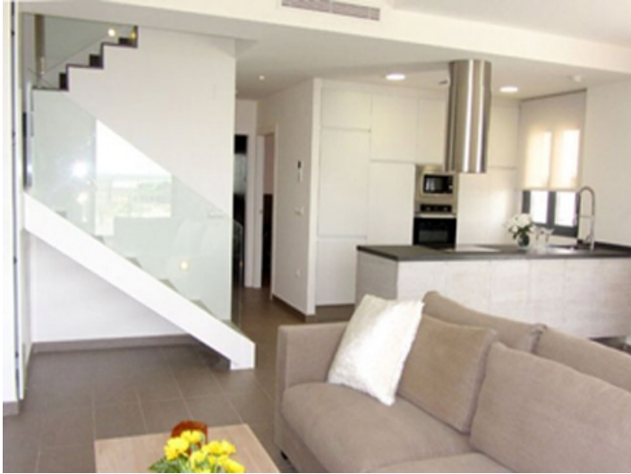
Newly built villa with modern design